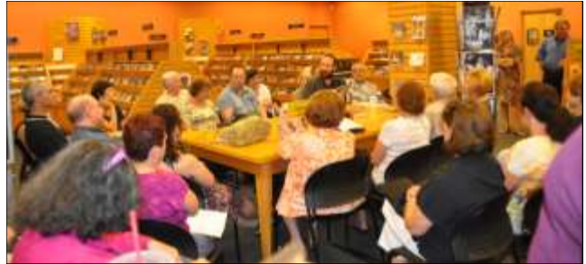
June 26, 2011 Event at Borders Bookstore

Winter Springs Town Center 1196 Tree Swallow Drive #1314 Winter Springs, FL 32708 Questions? Contact- 407-672-2049